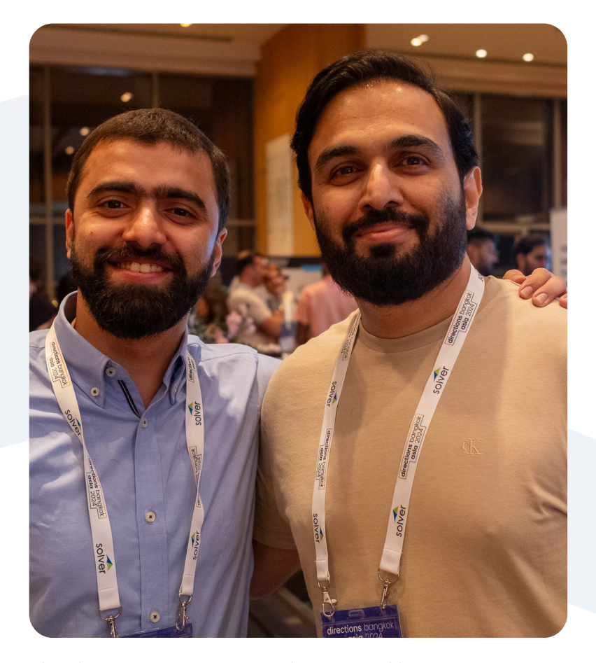
Directions ASIA 2025 sponsorship opportunities are based on availability, first-come, first-served, and may be sold out without notice.